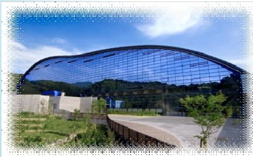
Kyushu National Museum

The island is also famous for the Hakata Ramen and Fukuoka's unique broth bowl of noodles, a favourite of locals and foreign travelers.