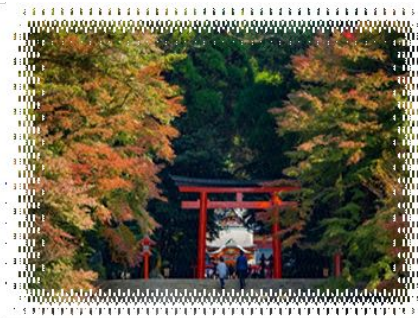
Kirishima Jingu Shrine